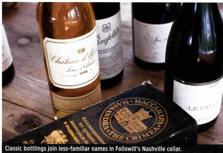
Classic bottlings join less-familiar names in Followill's Nashville cellar.