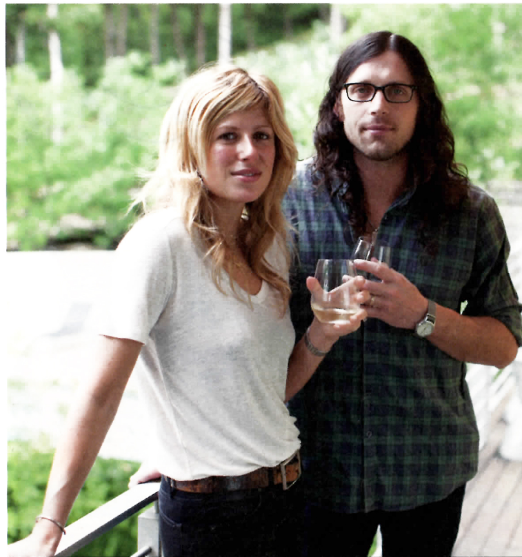
Kings of Leon drummer Nathan Followill with his wife, singer-songwriter Jessie Baylin

As the band's popularity soared, their wine experiences became more and more elaborate. "Sometimes promoters would buy us birthday year wines," Followill recalls. "I quickly realized 1979 was a horrible year for Old World red wines. Caleb was born in 1982 and Jared was born in 1986. Their wines kicked [my wine's] ass every time. Now I request